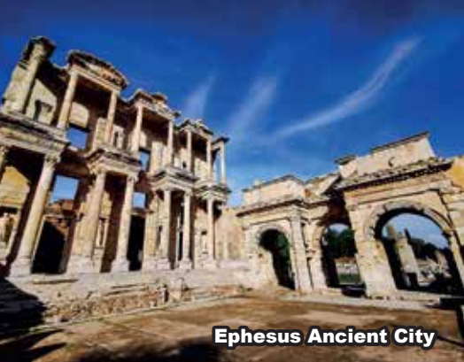
Ephesus Ancient City