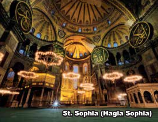
St. Sophia (Hagia Sophia)