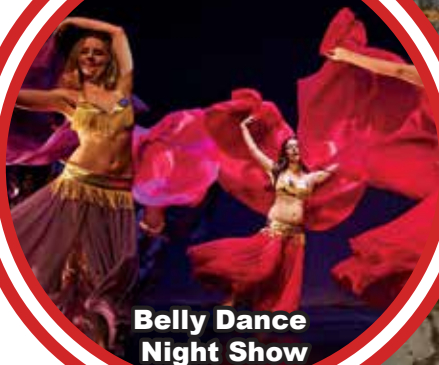
Belly Dance Night Show