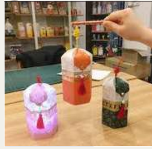
DIY Hanji Paper Doll 手作韩纸娃娃