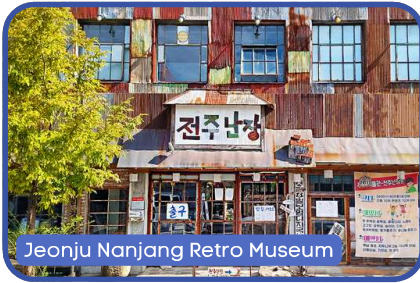
Jeonju Nanjang Retro Museum