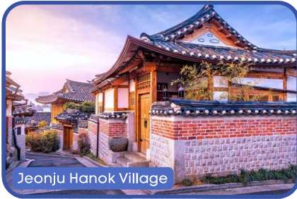
Jeonju Hanok Village