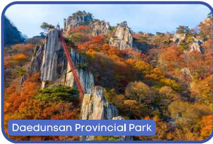
Daedunsan Provincial Park