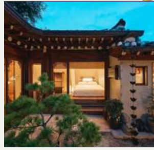
Hanok Stay Experience 体验入住传统韩屋