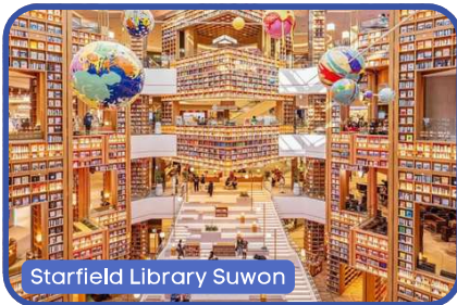
Starfield Library Suwon