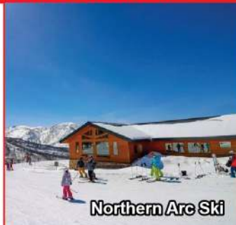
Northern Arc Ski

Sequences of Itinerary are subject to local arrangement.