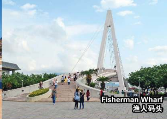
Fisherman Wharf 渔人码头