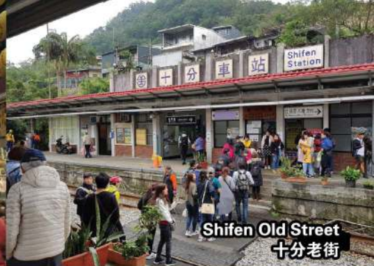
Shifen Old Street 十分老街