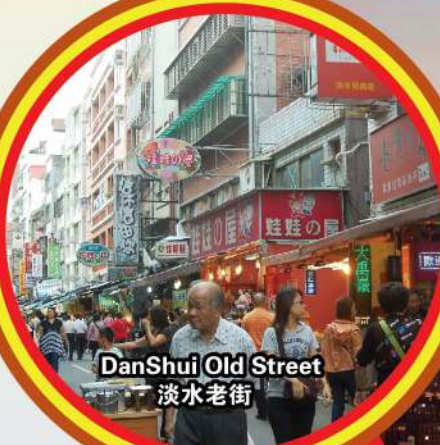
DanShui Old Street 淡水老街