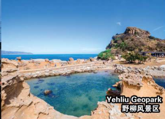
Yehliu Geopark 野柳风景区