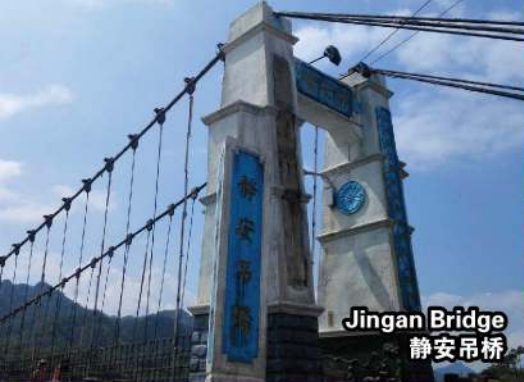
Jingan Bridge 静安吊桥