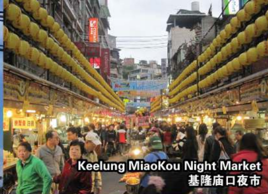
Keelung MiaoKou Night Market 基隆庙口夜市