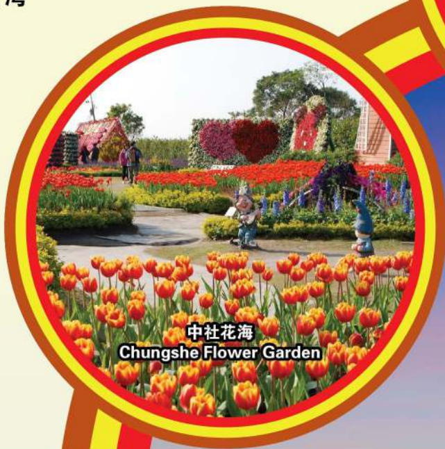
中社花海 Chungshe Flower Garden