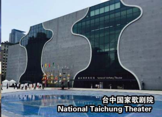
台中国家歌剧院 National Taichung Theater