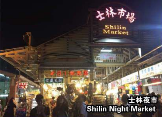
士林夜市 Shilin Night Market