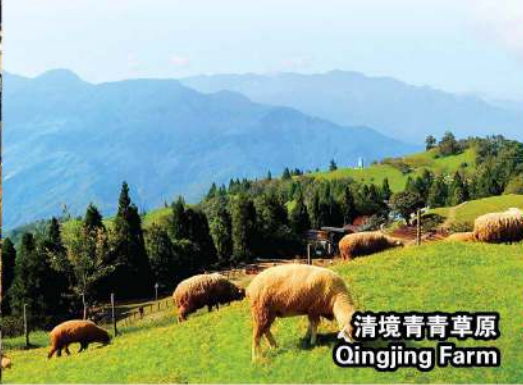
清境青青草原 Qingjing Farm