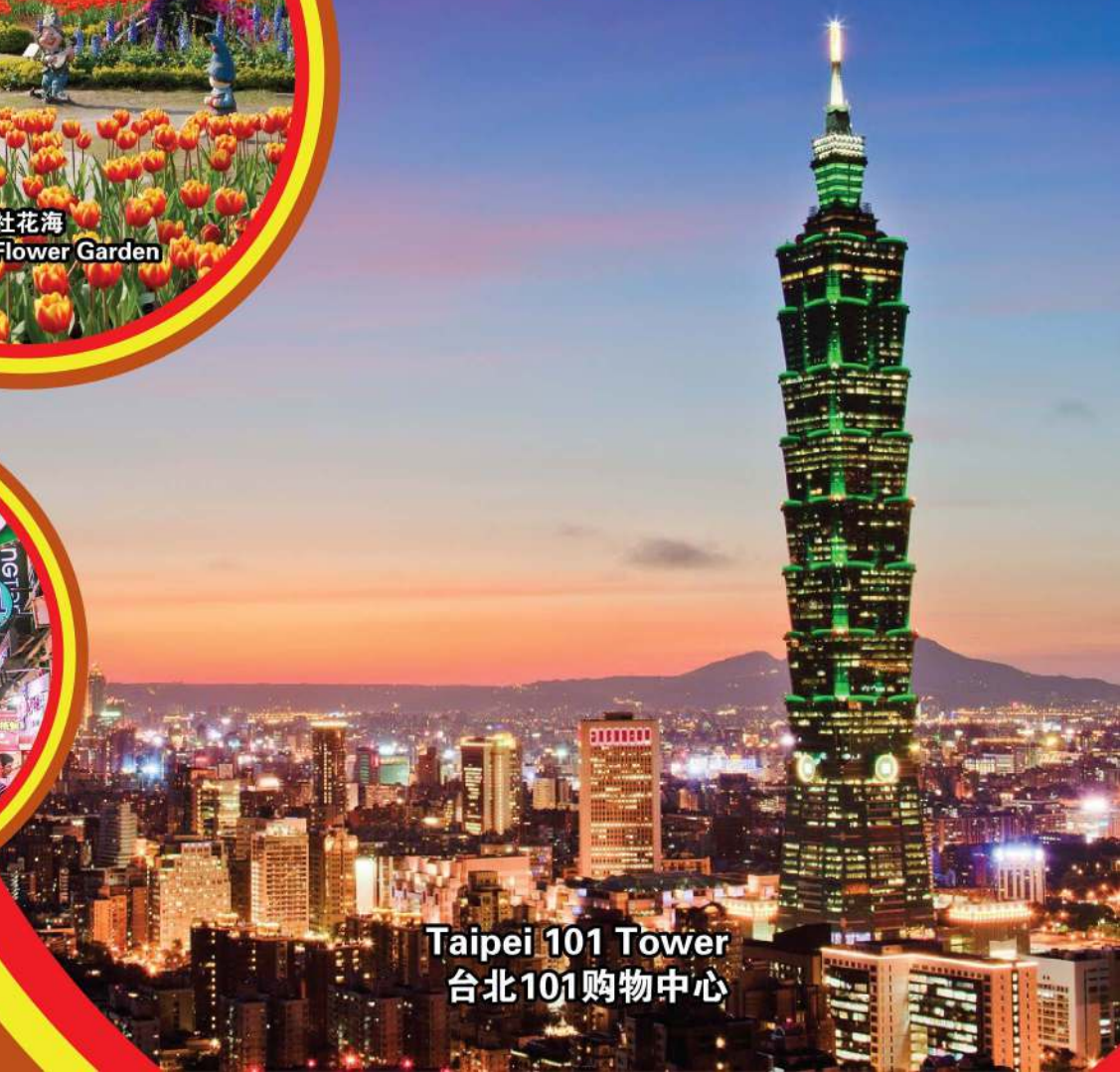
Taipei 101 Tower 台北101购物中心

行程次序·以当地旅社安排为准。 Sequences of Itinerary are subject to local arrangement.