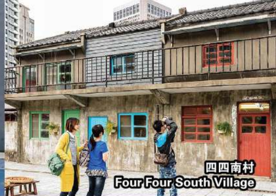
四四南村 Four Four South Village