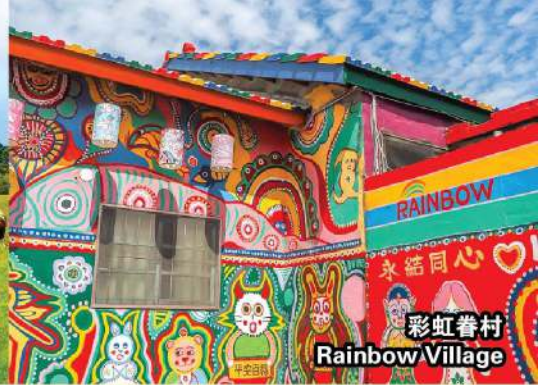
彩虹眷村 Rainbow Village