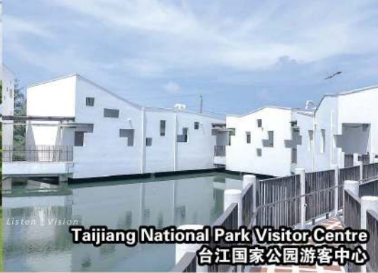
Taijiang National Park Visitor Centre 台江国家公园游客中心