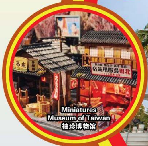
Miniatures Museum of Taiwan 袖珍博物馆