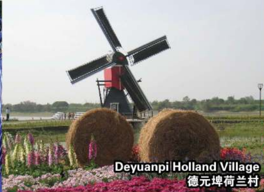
Deyuanpi Holland Village 德元埤荷兰村