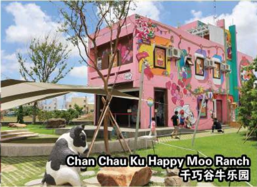
Chan Chau Ku Happy Moo Ranch 千巧谷牛乐园