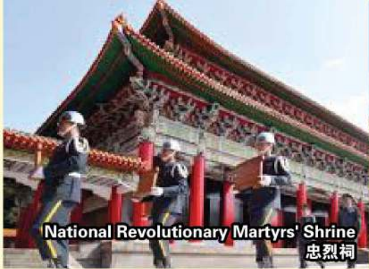
National Revolutionary Martyrs' Shrine 忠烈祠