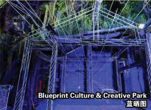
Blueprint Culture & Creative Park 蓝晒图