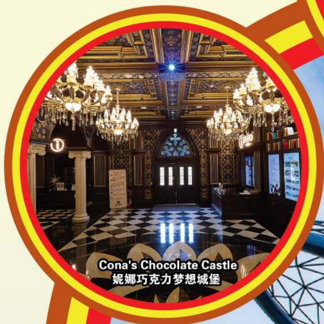
Cona's Chocolate Castle 妮娜巧克力梦想城堡