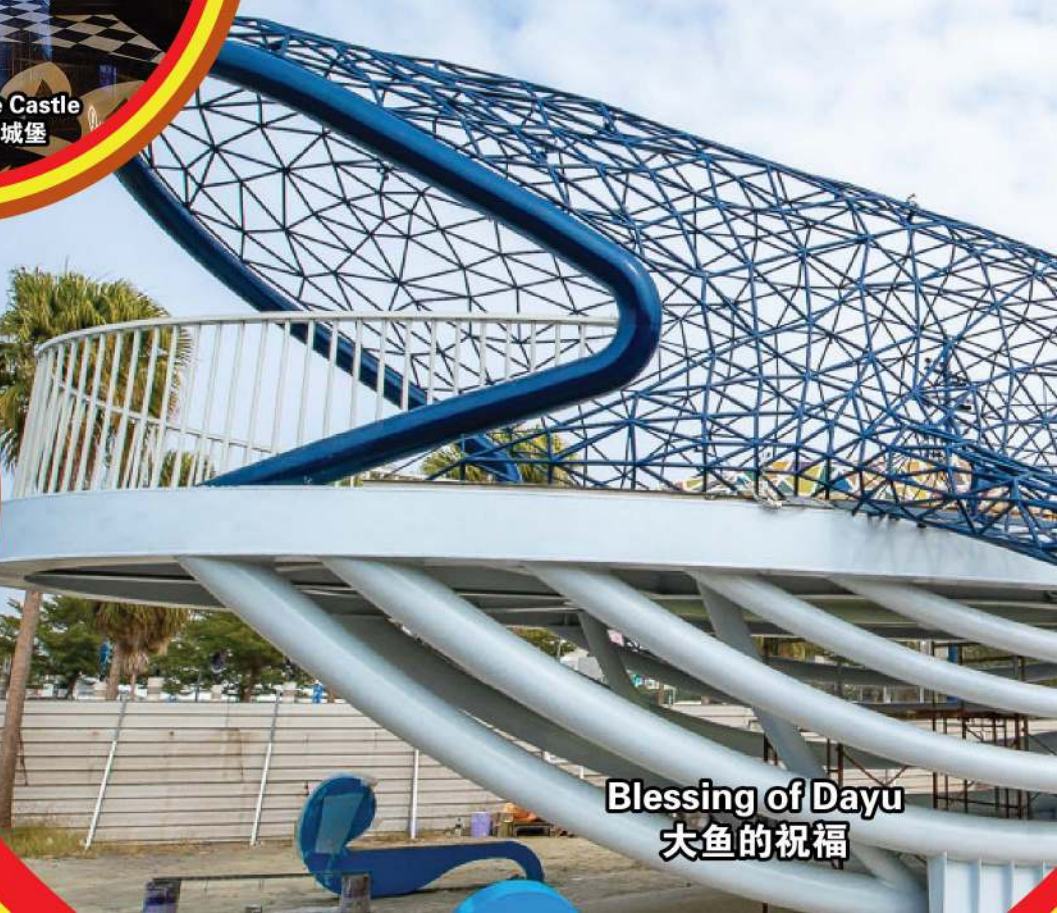
Blessing of Dayu 大鱼的祝福

行程次序，以当地旅社安排为准。 Sequences of Itinerary are subject to local arrangement.