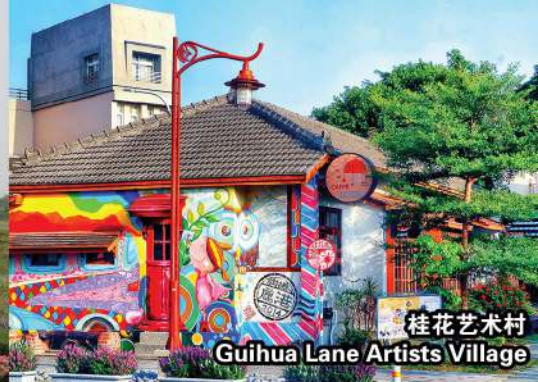
桂花艺术村 Guihua Lane Artists Village