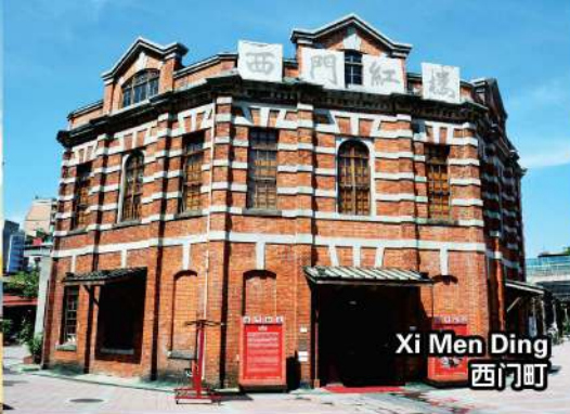
Xi Men Ding 西门町