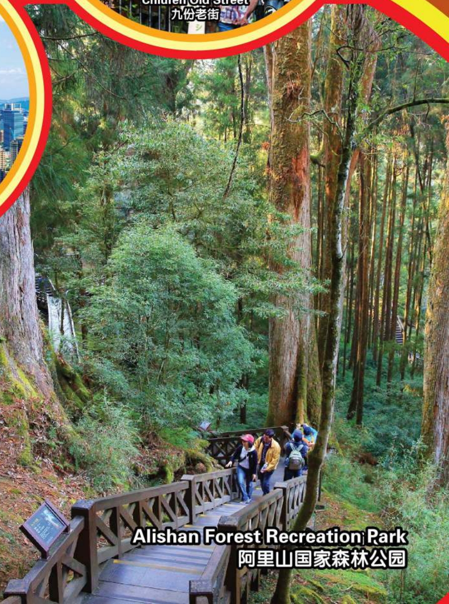
Alishan Forest Recreation Park 阿里山国家森林公园

行程次序，以当地旅社安排为准。 Sequences of Itinerary are subject to local arrangement.