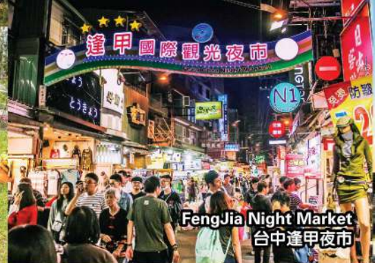
FengJia Night Market 台中逢甲夜市