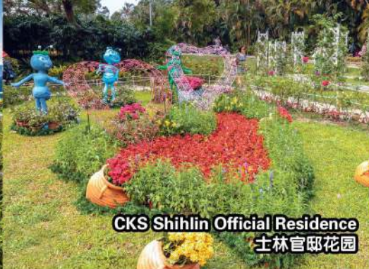
CKS Shihlin Official Residence 士林官邸花园