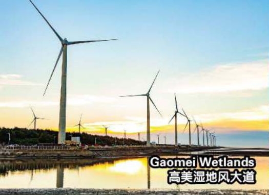
Gaomei Wetlands 高美湿地风大道