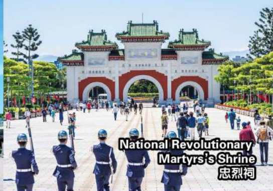
National Revolutionary Martyrs' Shrine 忠烈祠