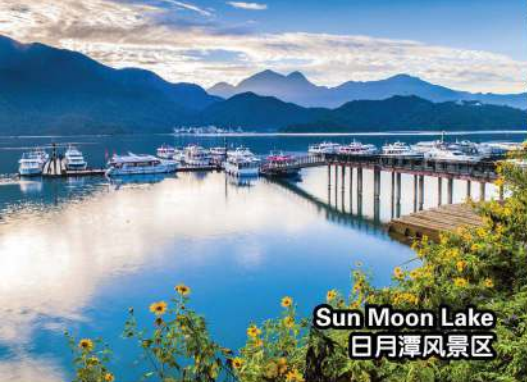
Sun Moon Lake 日月潭风景区