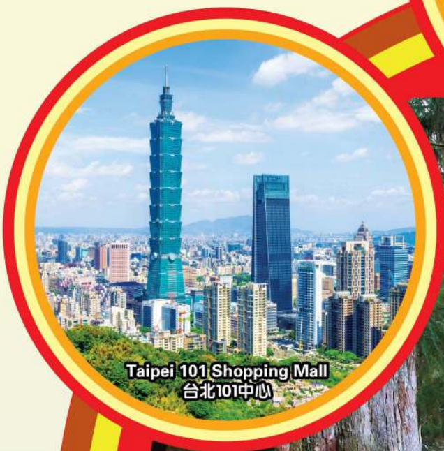
Taipei 101 Shopping Mall 台北101中心