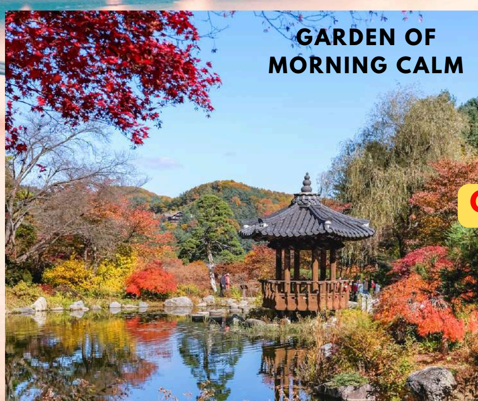
GARDEN OF MORNING CALM