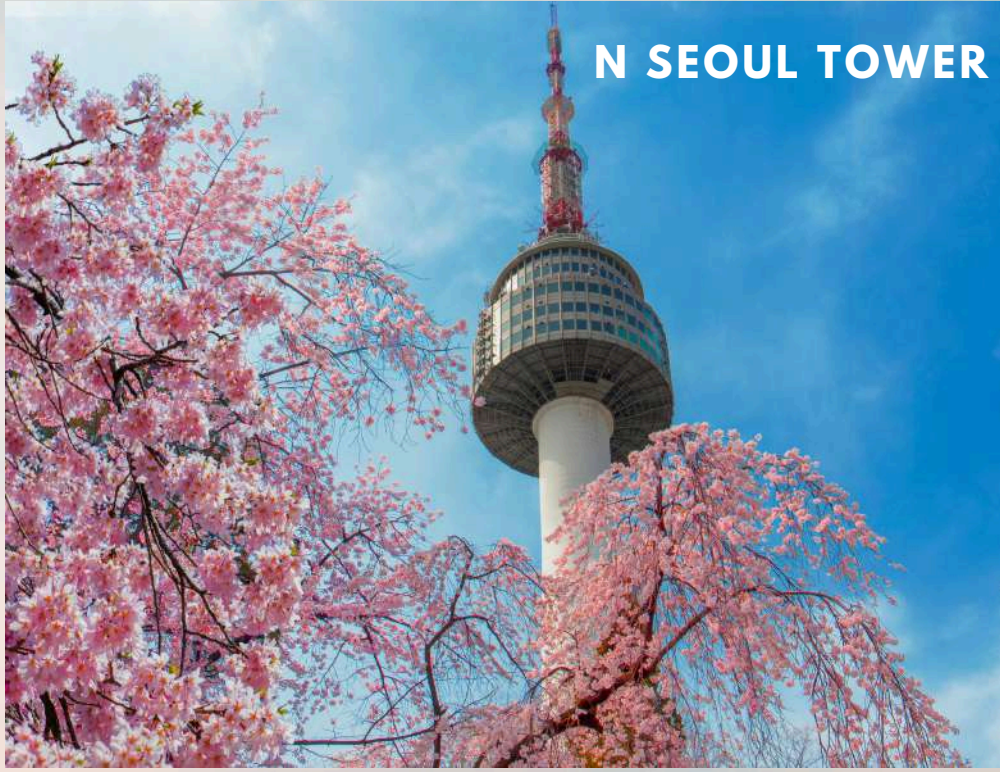
N SEOUL TOWER