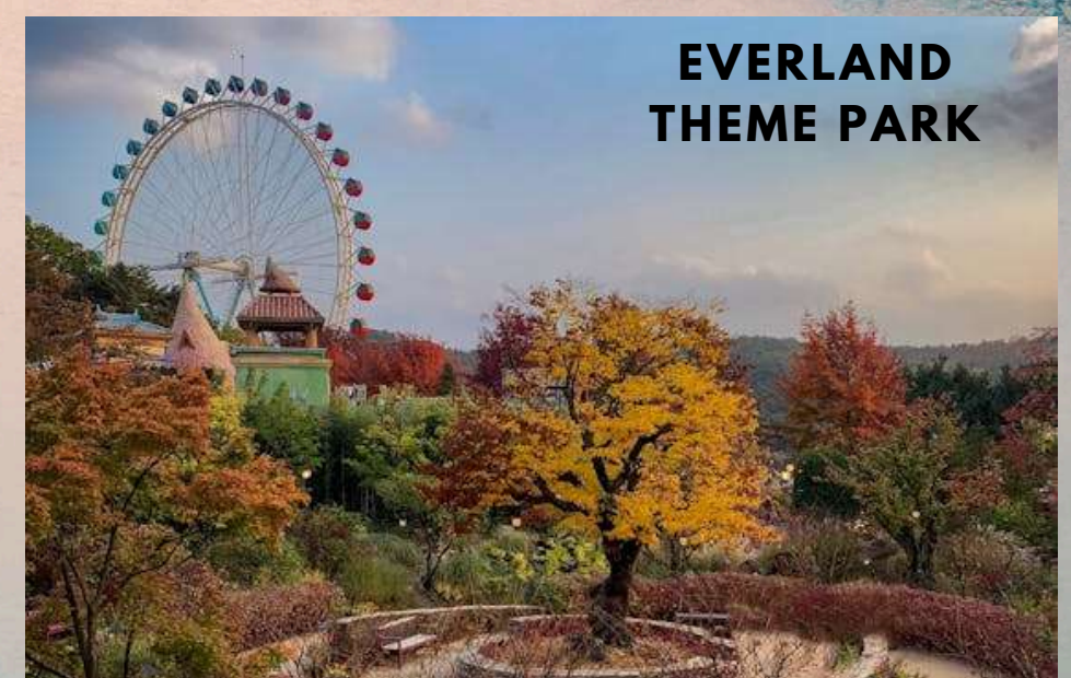
EVERLAND THEME PARK

🌸 季节限定体验: 4月中旬至5月中旬: 在首尔森林公园观赏郁金香花海 (视天气而定)。