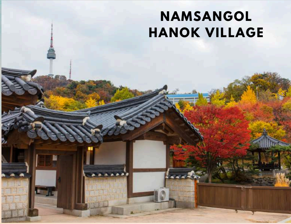
NAMSANGOL HANOK VILLAGE