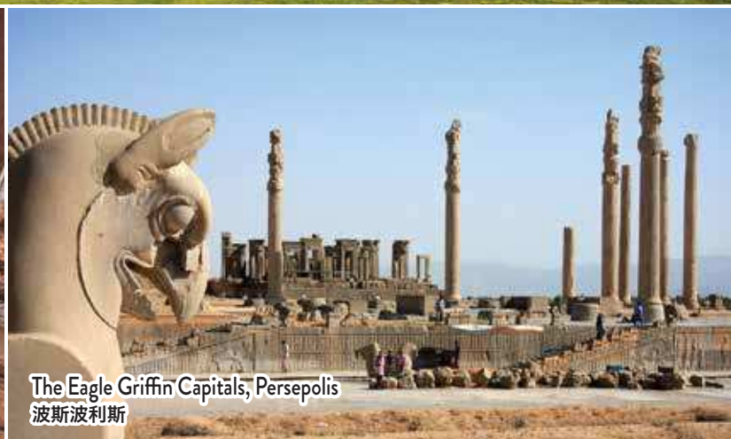
The Eagle Griffin Capitals, Persepolis 波斯波利斯