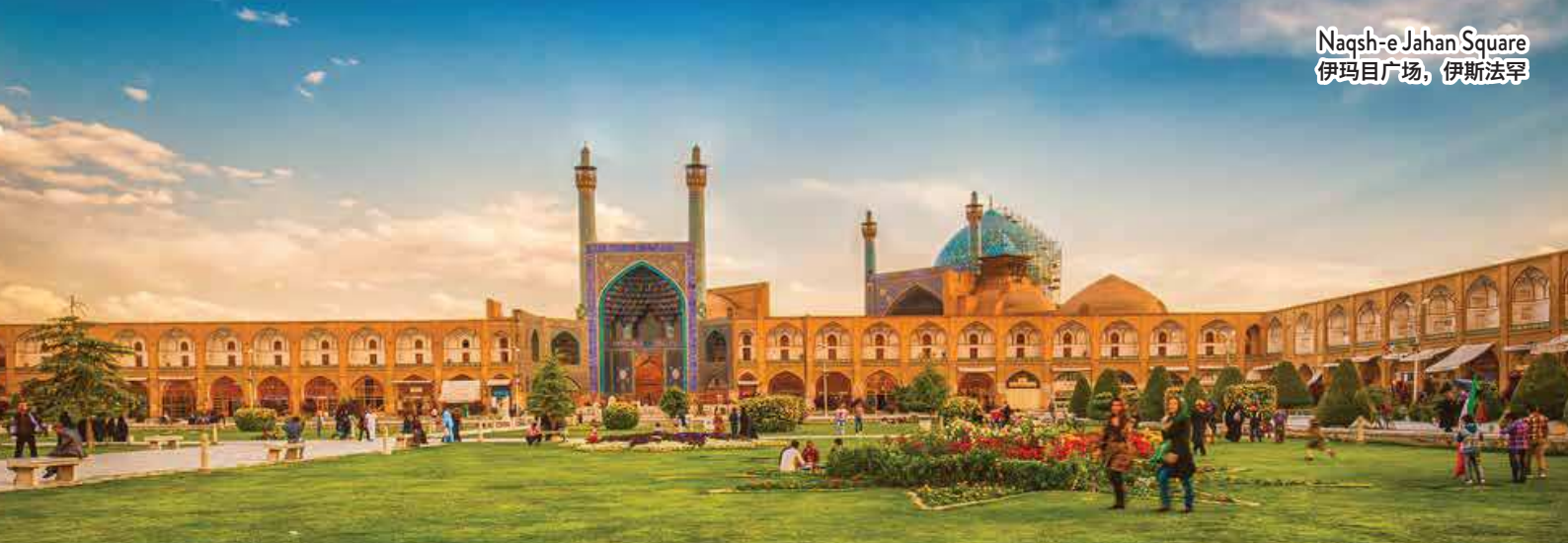
Naqsh-e Jahan Square 伊玛目广场，伊斯法罕