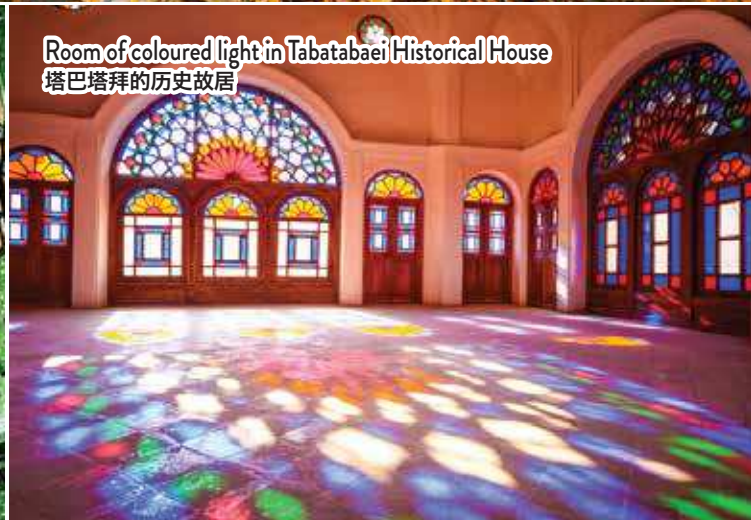
Room of coloured light in Tabatabaei Historical House 塔巴塔拜的历史故居