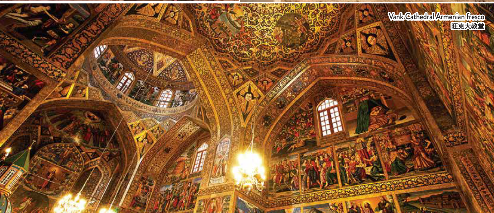
Vank Cathedral Armenian fresco 旺克大教堂