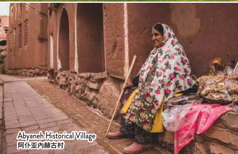
Abyaneh Historical Village 阿仆亚内赫古村