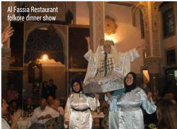
Al Fassia Restaurant folkore dinner show