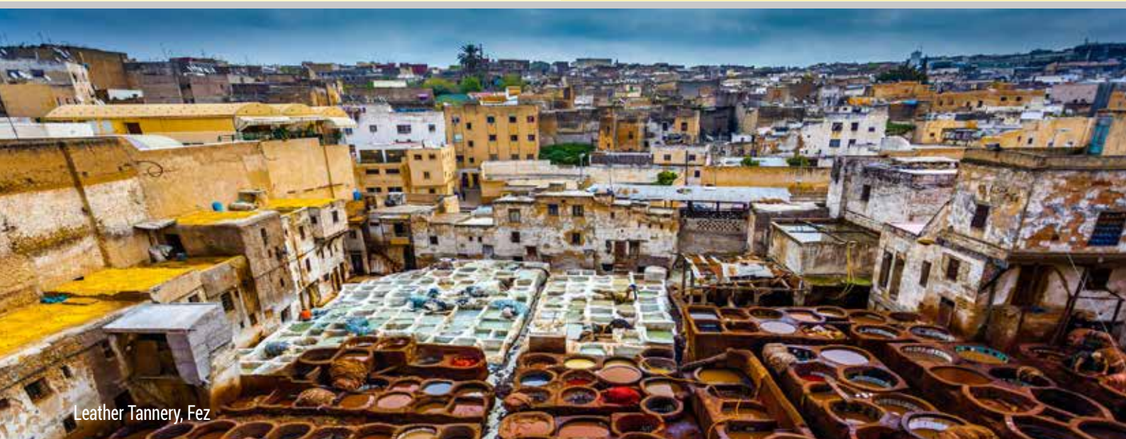
Leather Tannery, Fez