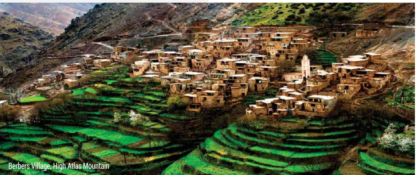
Berbers Village, High Atlas Mountain