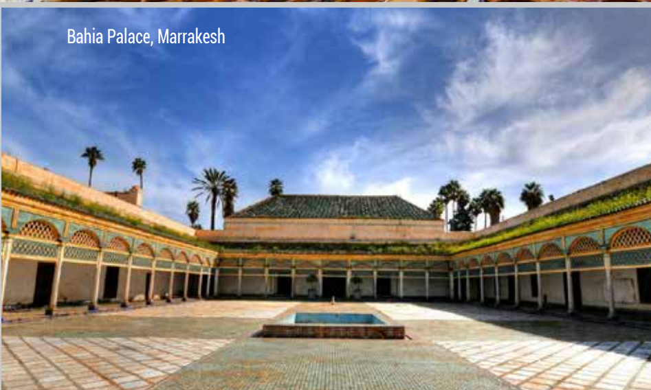
Bahia Palace, Marrakesh