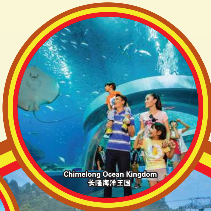
Chimelong Ocean Kingdom 长隆海洋王国