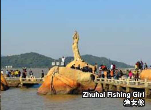
Zhuhai Fishing Girl 渔女像