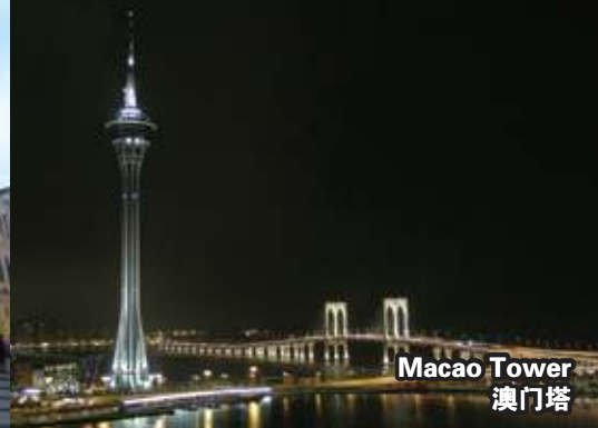
Macao Tower 澳门塔