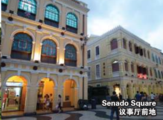
Senado Square 议事厅前地