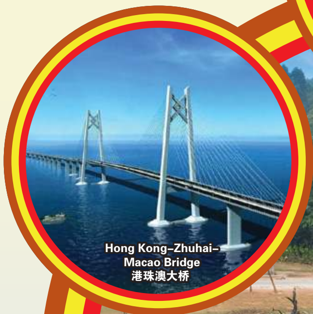
Hong Kong-Zhuhai- Macao Bridge 港珠澳大桥