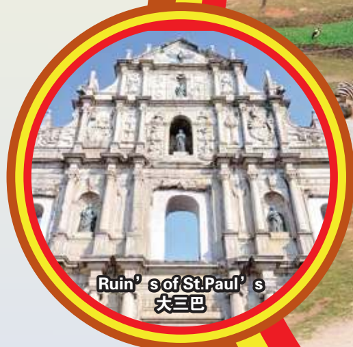
Ruin's of St.Paul's 大三巴