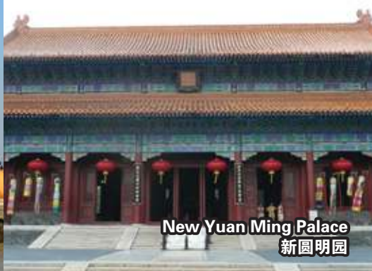
New Yuan Ming Palace 新圆明园