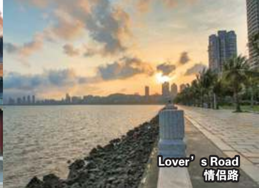
Lover's Road 情侣路