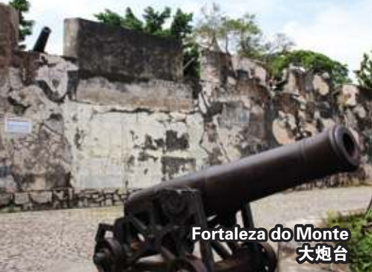
Fortaleza do Monte 大炮台