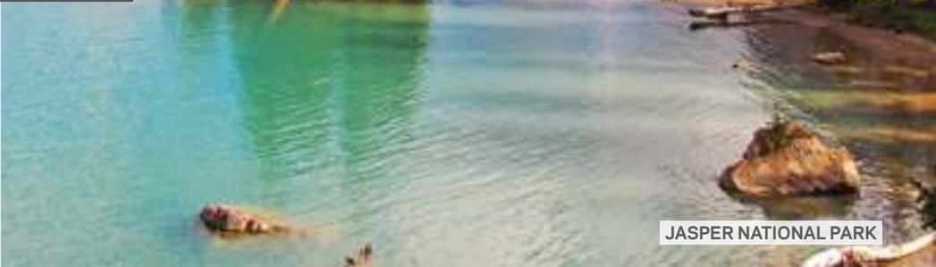
JASPER NATIONAL PARK

Add Hawaii before or after your holiday (see page 12)