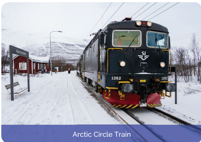
Arctic Circle Train

3. Tonight we will hunt the Northern Lights with a walk together with your tour manager.