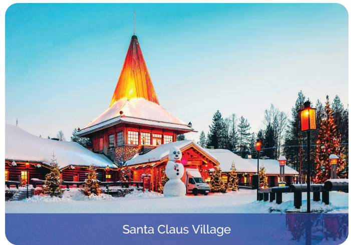
Santa Claus Village