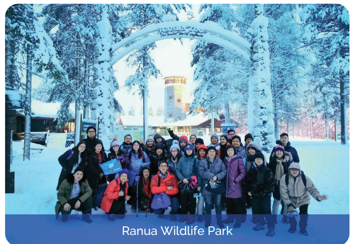
Ranua Wildlife Park