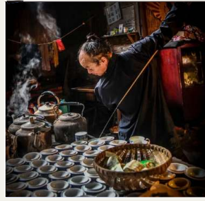
Gaiwan Tea Ceremony 盖碗茶体验