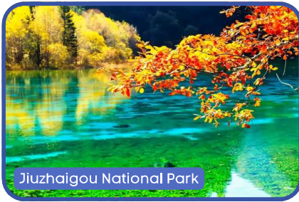
Jiuzhaigou National Park