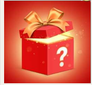
A Surprise Gift 惊喜好礼 T&C Applied*