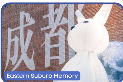
Eastern Suburb Memory