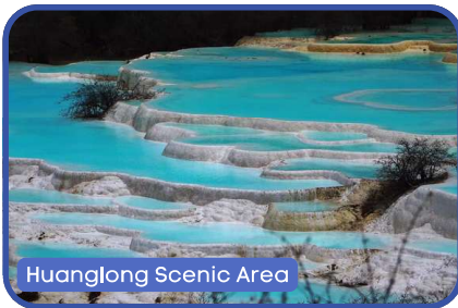
Huanglong Scenic Area