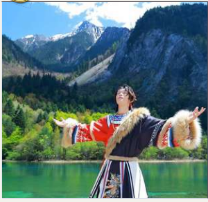
Jiuzhai Dress-Up & Shoot 九寨沟旅拍体验