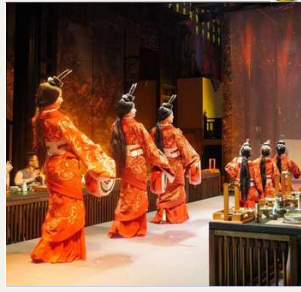
Shu-style Banquet Dinner 蜀宴赋晚宴