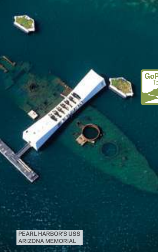
PEARL HARBOR'S USS ARIZONA MEMORIAL

Day 4 HONOLULU-HILO-HAWAII VOLCANOES NATIONAL PARK-KONA. This morning, depart for Hilo on the "Big Island" of Hawaii with its spectacular scenery that includes misty plateaus, craggy cliffs, tropical rainforests, bamboo groves, and lava deserts. On arrival, tour HAWAII VOLCANOES NATIONAL PARK . See Kilauea Crater, rising 4,090 feet above a volcanic wonderland of steaming fire pits, lava tubes, and fern forests. Arrive in Kona on the sunny side of the "Big Island" in the early evening.