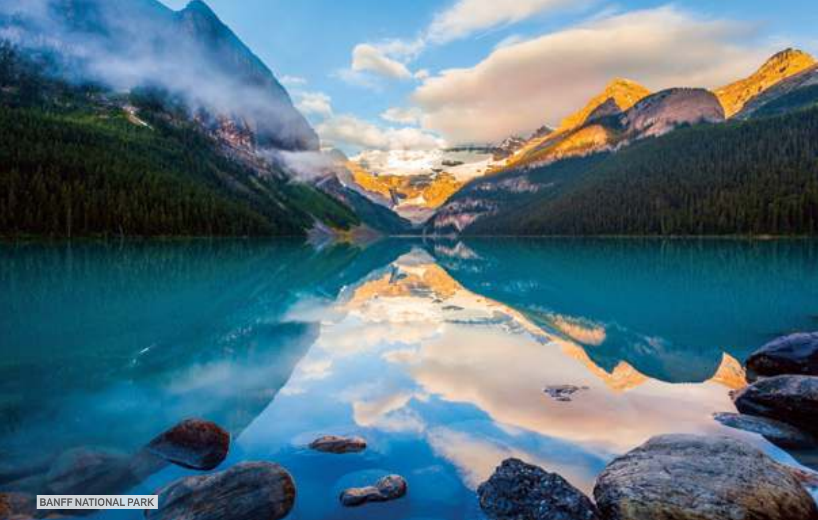
BANFF NATIONAL PARK