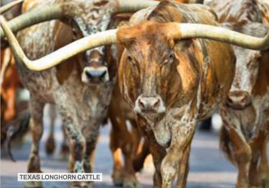
TEXAS LONGHORN CATTLE

Day 2 DALLAS. This morning, enjoy a guided tour of North Texas Horse Country, one of the largest concentrations of horse farms in the United States. Visit a real working HORSE RANCH with a knowledgeable local guide for a true authentic experience. See beautiful vistas, relaxing backroads, and the gorgeous countryside—home to a variety of horse breeds and disciplines, including Quarter Horses, Thoroughbreds, Paints, Arabians, Appaloosas, and Warmbloods... they are all here. In the afternoon, return to Dallas for included city sightseeing that features Pioneer Plaza, commemorating the trails that brought settlers to Dallas and cattle to market; the Historic West End; and Dealey Plaza, where history buffs can learn all about that moment in history at the SIXTH FLOOR MUSEUM, the location from