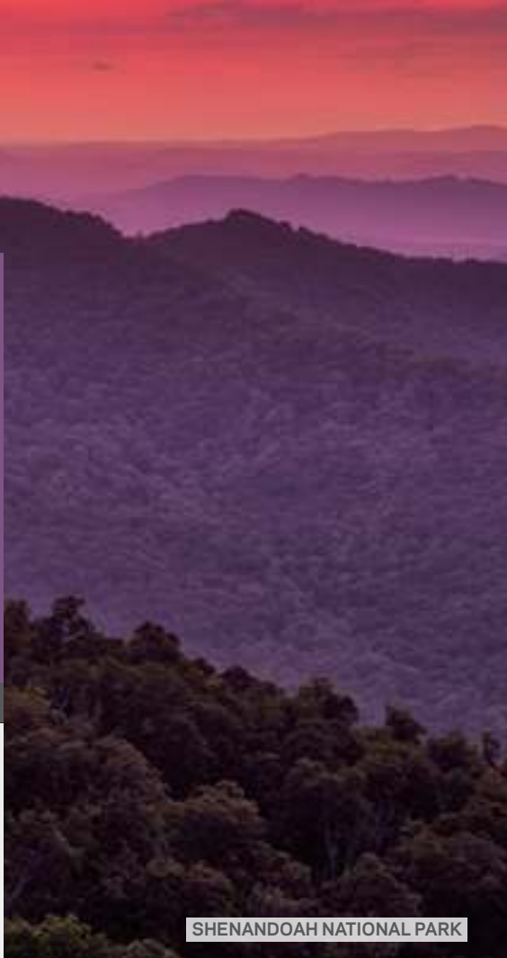
SHENANDOAH NATIONAL PARK

ARLINGTON CEMETERY. Your guided tour of the capital continues, with photo stops at Capitol Hill and the White House, and visits to the Lincoln and Vietnam Memorials. Afterward, cross the Mason-Dixon Line into Pennsylvania, and visit the Gettysburg National Military Park MUSEUM AND VISITOR CENTER. Tonight, we offer an optional outing to a local restaurant to enjoy the flavour of the area.