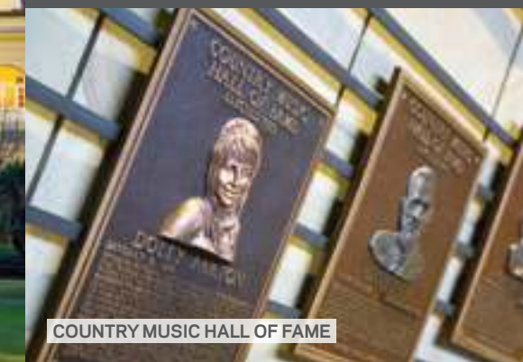
COUNTRY MUSIC HALL OF FAME