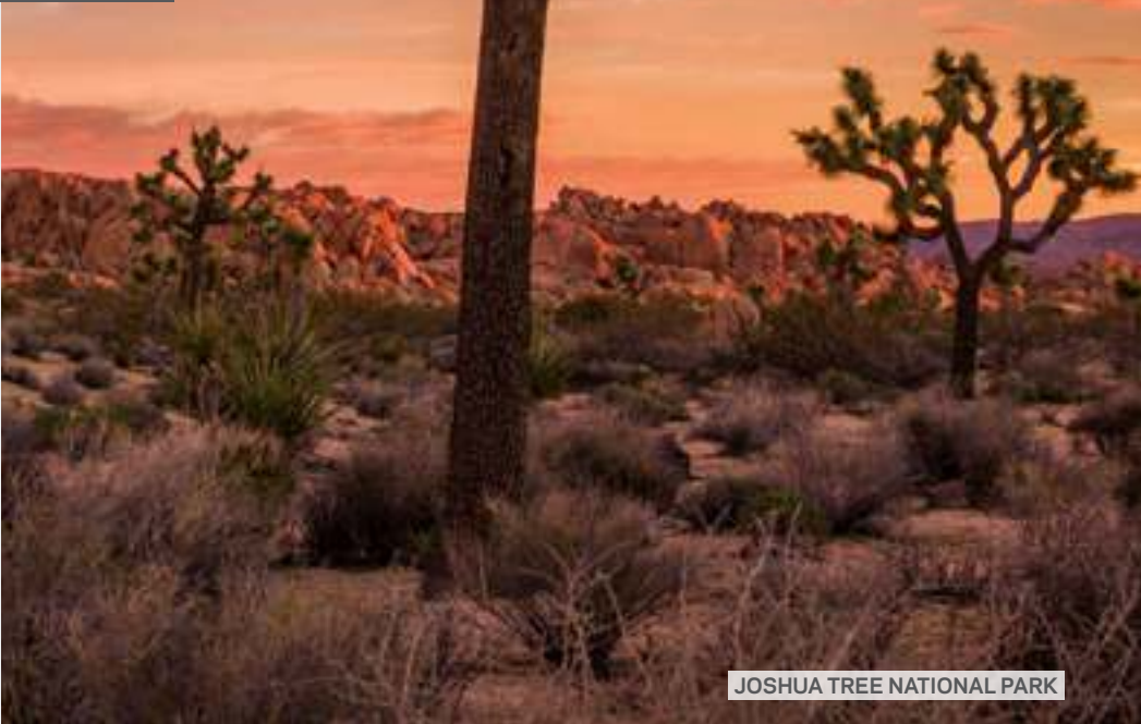
JOSHUA TREE NATIONAL PARK

Add Hawaii before or after your holiday (see page 12)