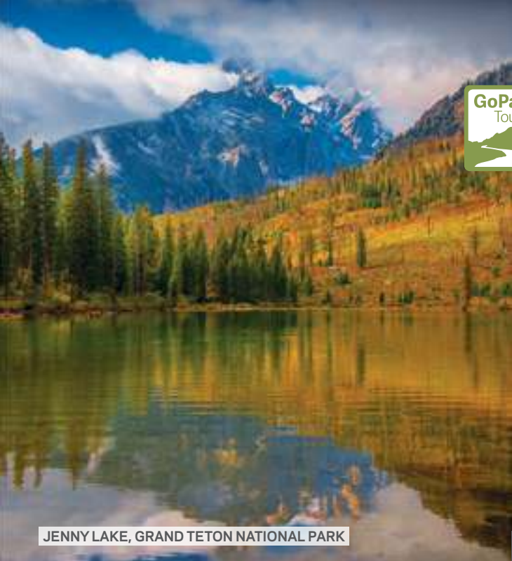
JENNY LAKE, GRAND TETON NATIONAL PARK

Day 9 ALPINE-SALT LAKE CITY. Today, travel to Salt Lake City, Utah's vibrant capital. Set on the edge of Great Salt Lake Desert, this centre of the Mormon religion is where Brigham Young declared to his followers, “This is the place.” An included sightseeing tour