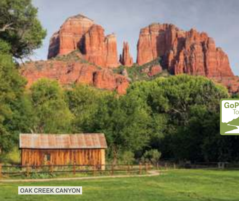
OAK CREEK CANYON

Day 4 PALM SPRINGS-SCOTTSDALE. Travel through cacti-covered desert towards Old Town Scottsdale where Western storefronts create an aura of the past. Afterward, enjoy free time to explore a taste of the Old West with restaurants, shopping, and Western bars. With wooden beams, wagon wheels, and cowboy hats abundant, you will feel like you have travelled back in time to the era of outlaws and saloons.