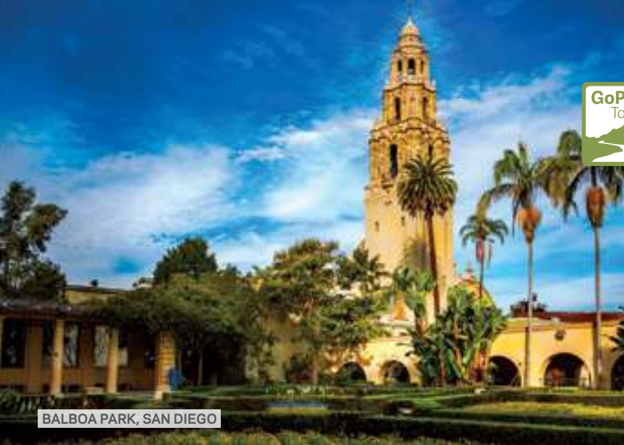
BALBOA PARK, SAN DIEGO

Day 3 LOS ANGELES-JOSHUA TREE NATIONAL PARK-PALM SPRINGS Today begins with a visit to JOSHUA TREE NATIONAL PARK with more than 800,000 acres, two deserts, two ecosystems, and a unique habitat, including the ancient Joshua trees. Continue to the desert playground of Palm Springs. Your afternoon is free for exploring the downtown area or joining the optional Palm Springs aerial tram—the world's largest rotating tram car, with breathtaking views of the valley floor below.