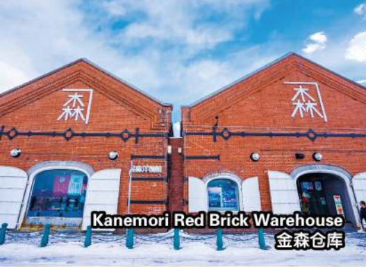
Kanemori Red Brick Warehouse 金森仓库