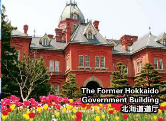
The Former Hokkaido Government Building 北海道庁