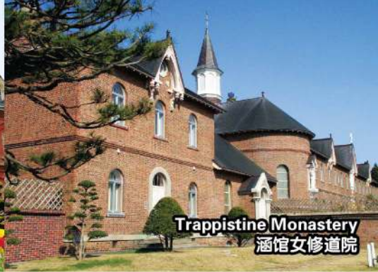
Trappistine Monastery 函館女修道院