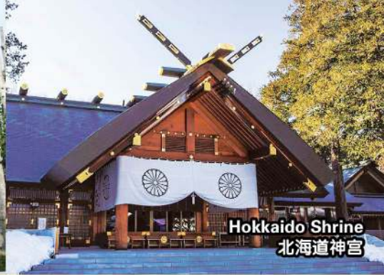
Hokkaido Shrine 北海道神宫