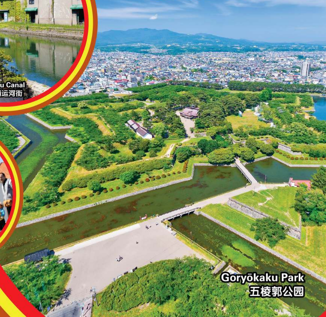
Goryokaku Park 五稜郭公园

行程次序·以当地旅社安排为准。 Sequences of Itinerary are subject to local arrangement.