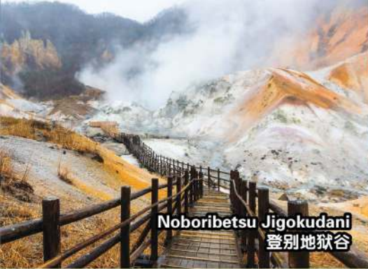
Noboribetsu Jigokudani 登别地狱谷