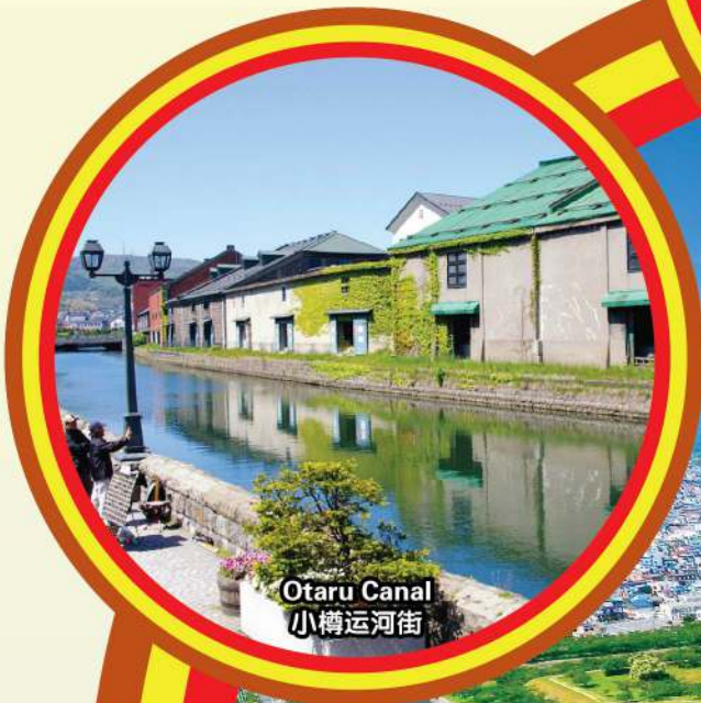
Otaru Canal 小樽运河街