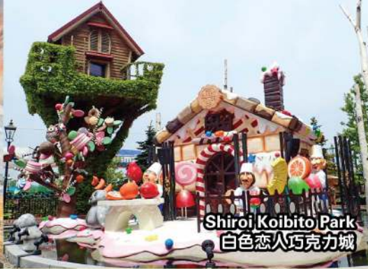
Shiroi Koibito Park 白色恋人巧克力城