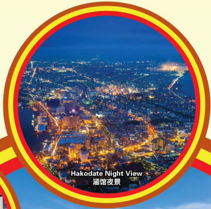
Hakodate Night View 函馆夜景