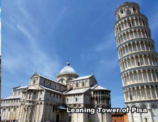
Leaning Tower of Pisa