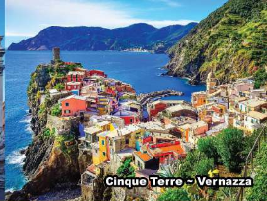
Cinque Terre ~ Vernazza