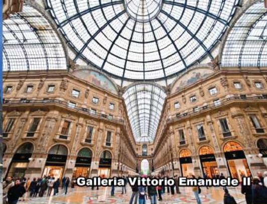
Galleria Vittorio Emanuele II