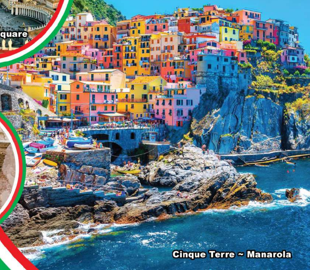
Cinque Terre ~ Manarola