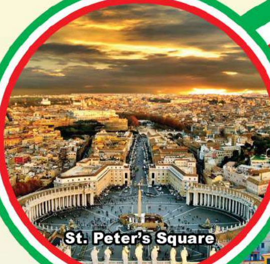
St. Peter's Square