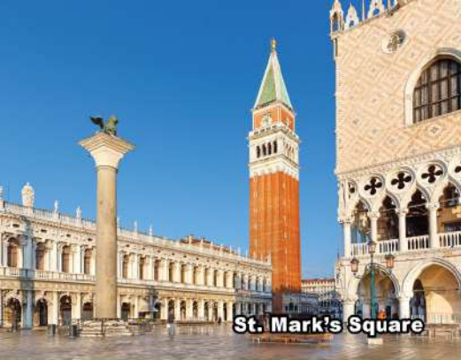
St. Mark's Square