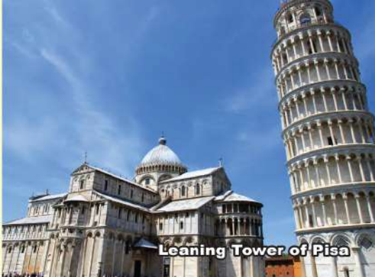
Leaning Tower of Pisa