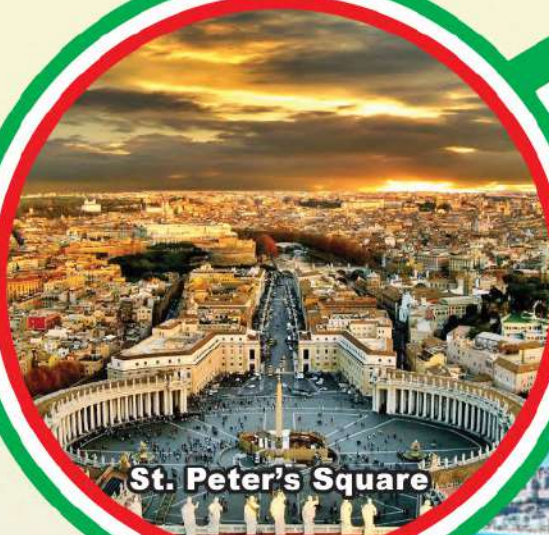
St. Peter's Square