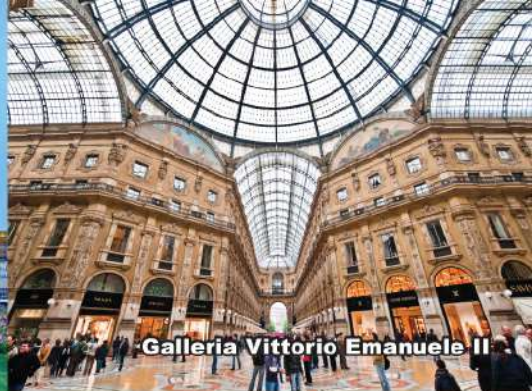
Galleria Vittorio Emanuele II