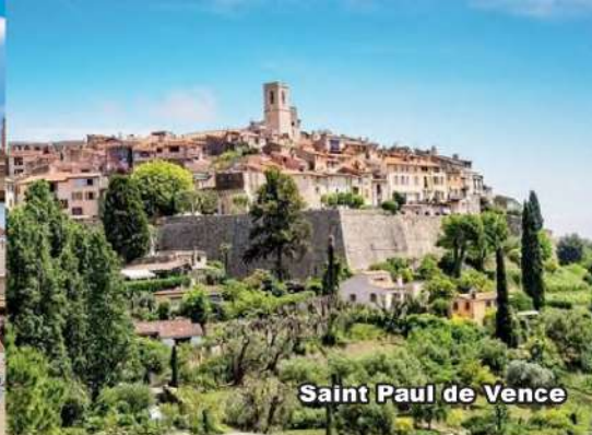
Saint Paul de Vence