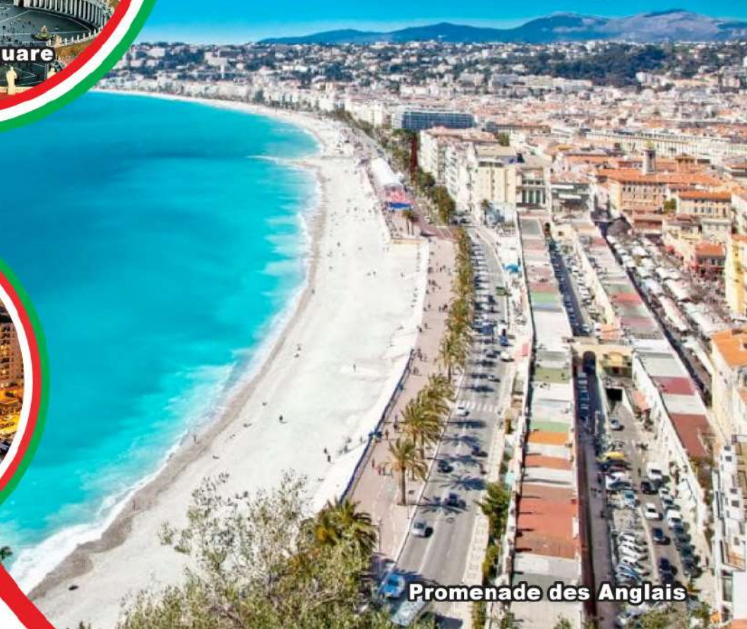
Promenade des Anglais