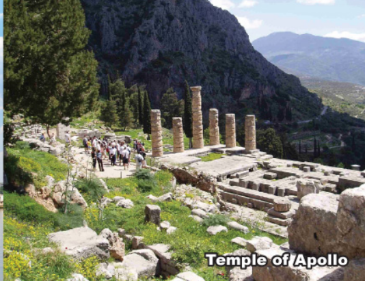
Temple of Apollo