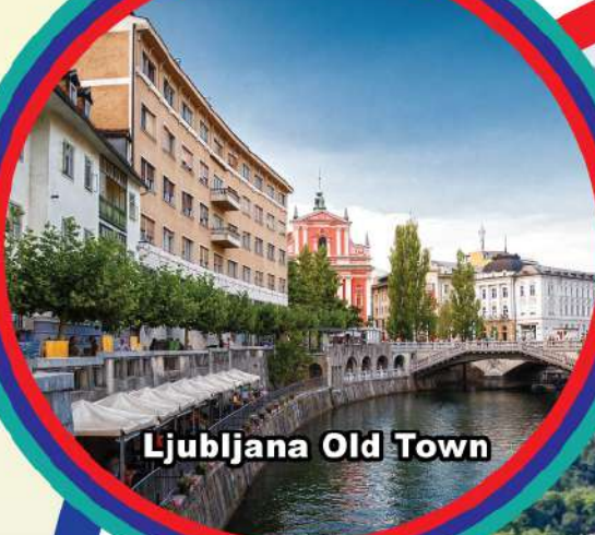
Ljubljana Old Town