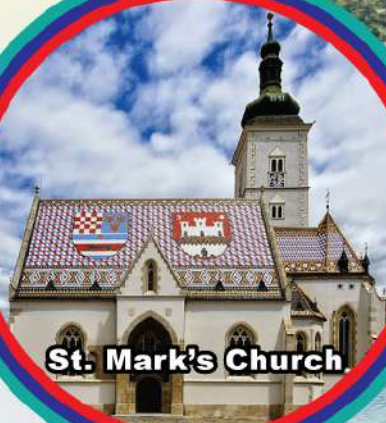
St. Mark's Church