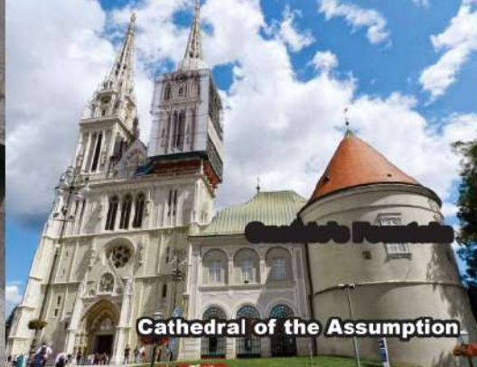
Cathedral of the Assumption