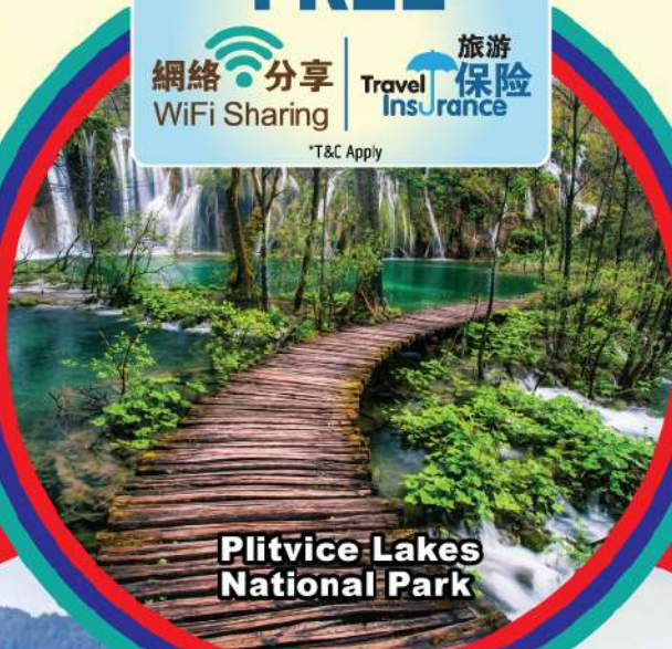
Plitvice Lakes National Park