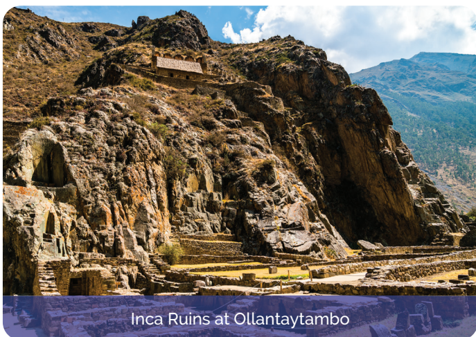
Inca Ruins at Ollantaytambo