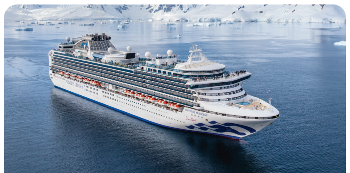
Sapphire Princess Cruise