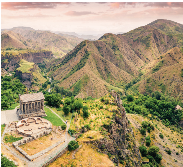
The Temple of Garni