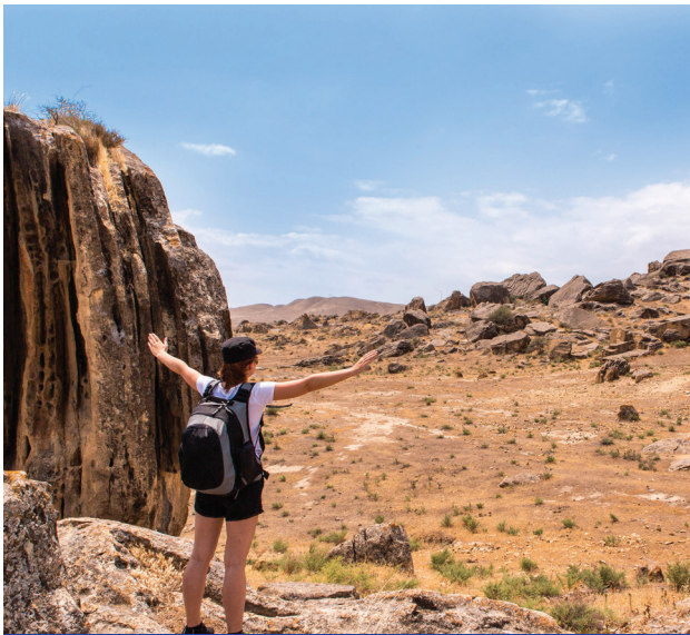
Gobustan Rock Art Cultural Landscape