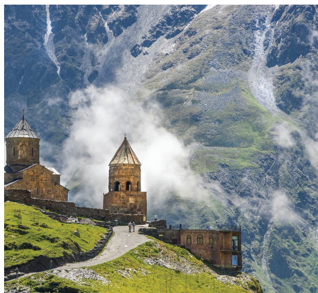
Gergeti Trinity Church