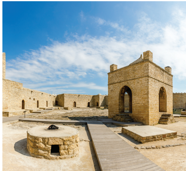
Atashgah Zoroastrian Fire Worshipping Temple