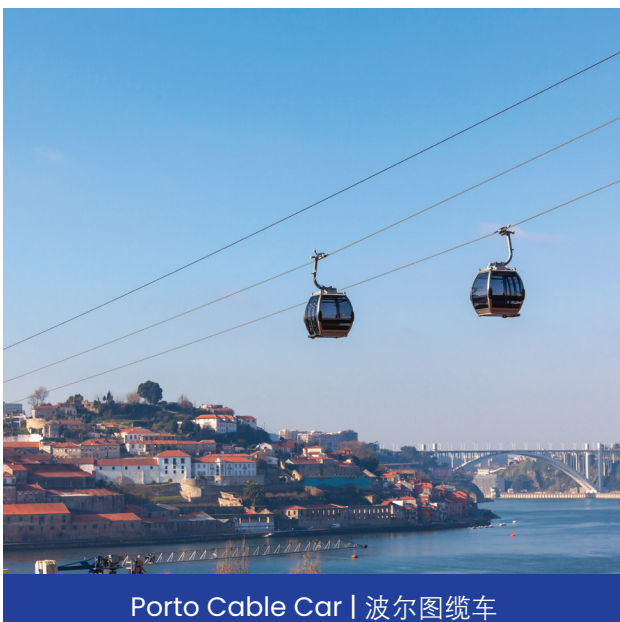
Porto Cable Car | 波尔图缆车