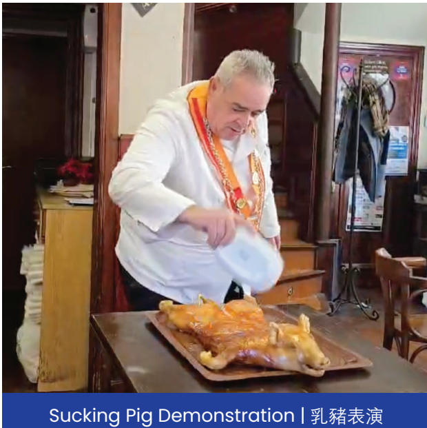
Suckling Pig Demonstration | 乳豬表演