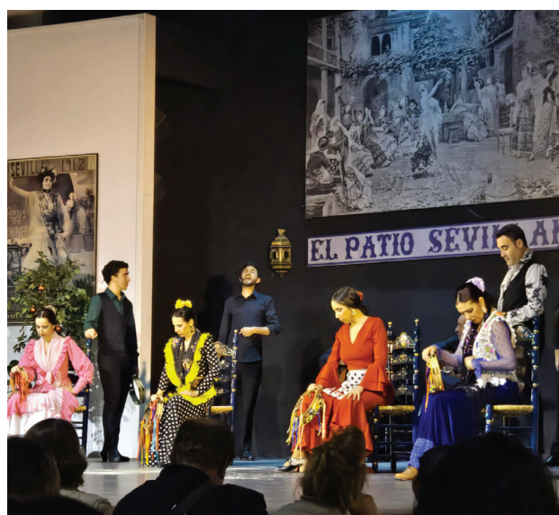
Flamenco Show | 弗拉明戈舞蹈表演