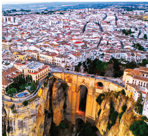
Ronda | 龙达