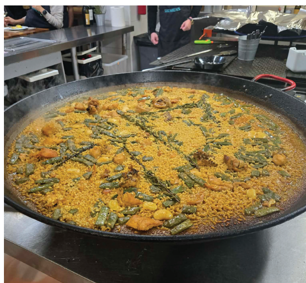
Paella Workshop | 西班牙饭烹饪课程体验