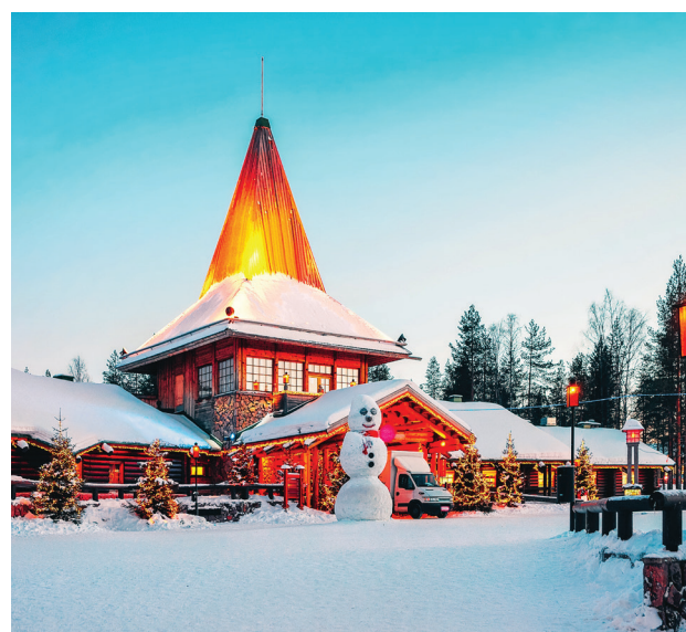
Santa Claus Village