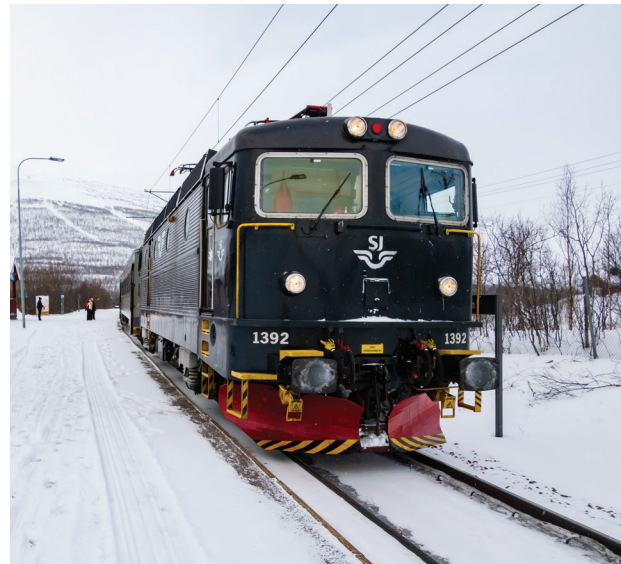
Arctic Circle Train