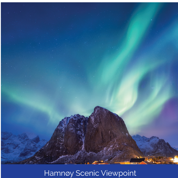
Hamnøy Scenic Viewpoint