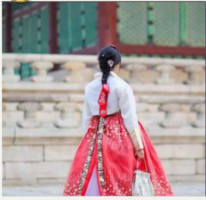
Hanbok Wearing Experience 韩服体验