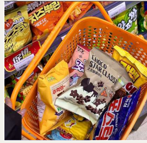
Exclusive Leisure Moments 悠游慢享时刻