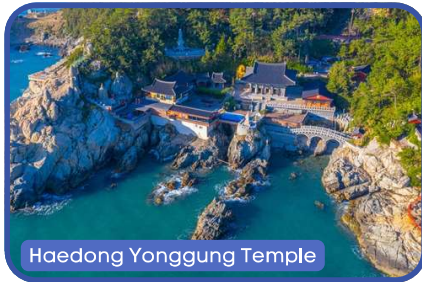
Haedong Yonggung Temple