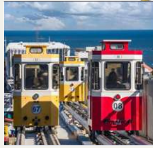
Sky Capsule Ride in Busan 体验釜山天空胶囊列车