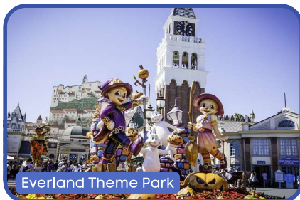
Everland Theme Park