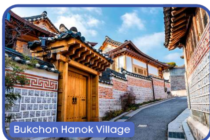
Bukchon Hanok Village