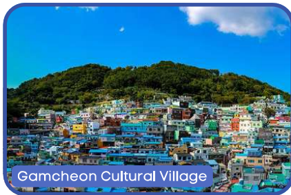
Gamcheon Cultural Village