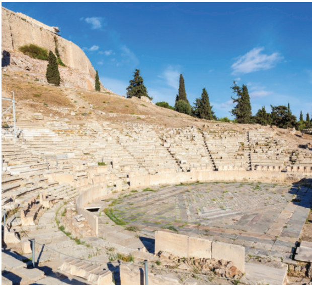
Theatre of Dionysos | 狄俄尼索斯剧场