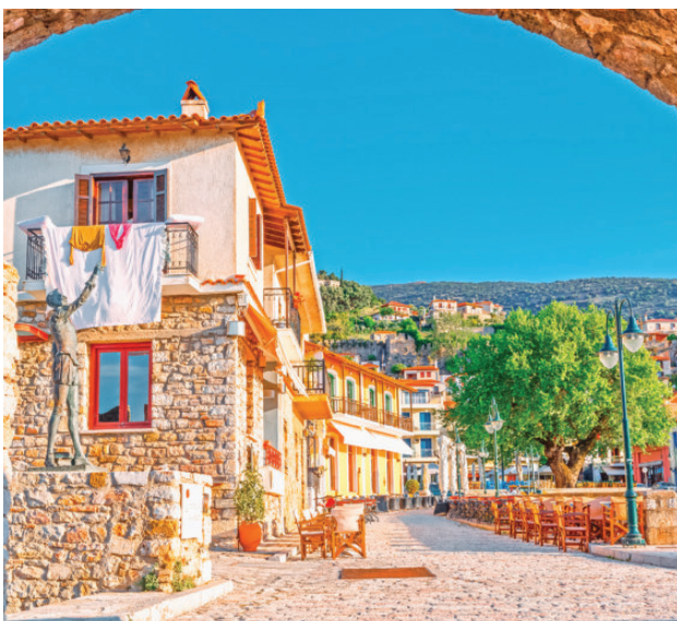
Nafpaktos | 纳夫帕克托斯