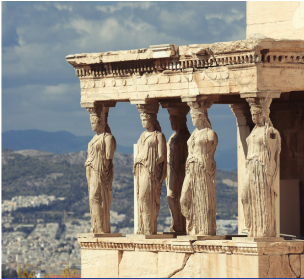
Erechtheion | 厄瑞克忒翁神庙