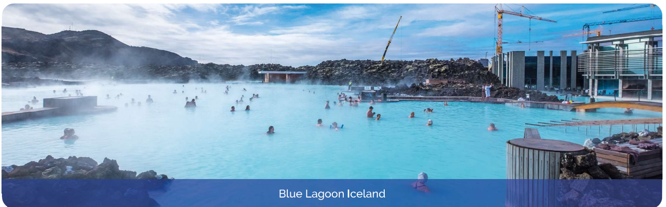
Blue Lagoon Iceland