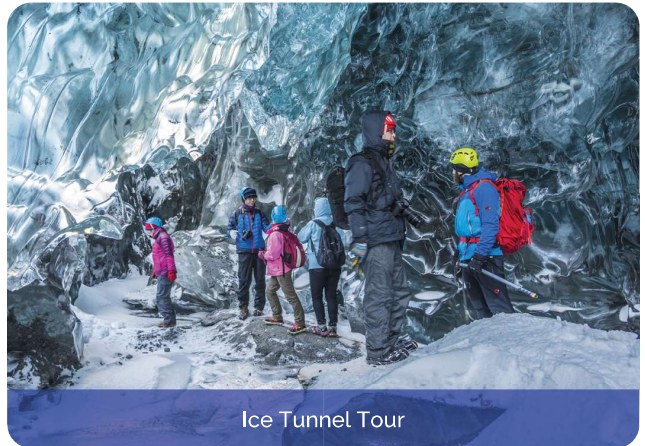
Ice Tunnel Tour