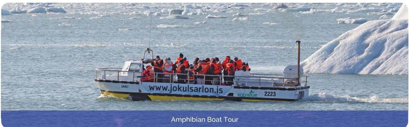
Amphibian Boat Tour