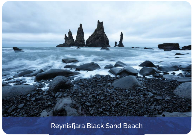
Reynisfjara Black Sand Beach