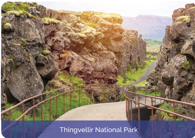
Thingvellir National Park