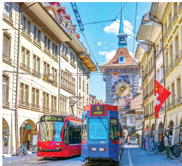
Bern Old Town (UNESCO) | 伯尔尼老城区