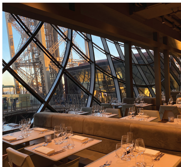
Madame Brasserie | 巴黎女士啤酒屋