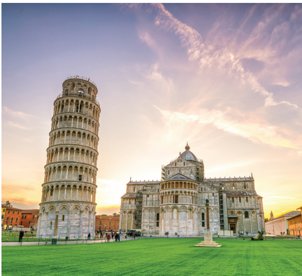
Square of Miracles | 奇迹广场