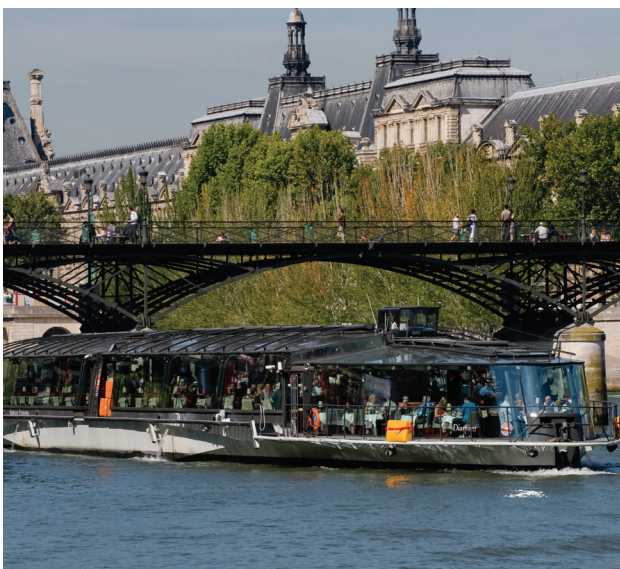
Bateaux Parisiens Cruise | 游船