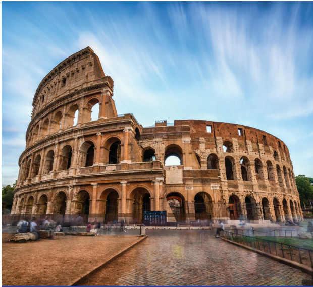
Colosseum | 罗马斗兽场