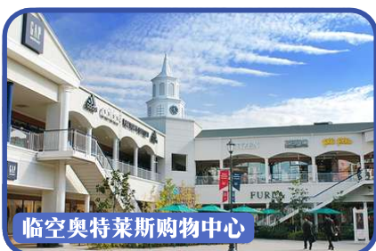
临空奥特莱斯购物中心