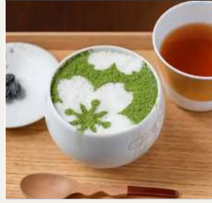
Matcha Teatime Leisure 日式抹茶体验