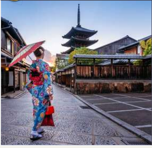
Kimono Wearing Experience 和服体验