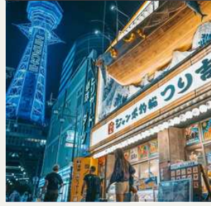
Exclusive Leisure Moments 悠游慢享时刻