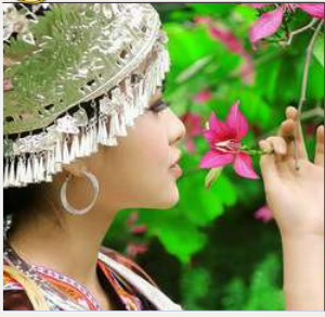
Miao Dress-Up & Shoot 苗族旅拍体验