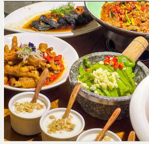
In-depth Xiangxi Delicacy 细品湘菜美食