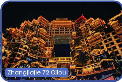
Zhangjiajie 72 Qilou