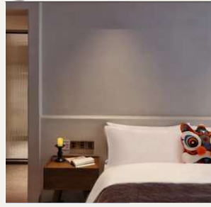
Local 5-Star Hotel Guarantee 当地五星住宿保证