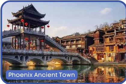
Phoenix Ancient Town