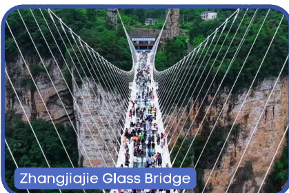
Zhangjiajie Glass Bridge