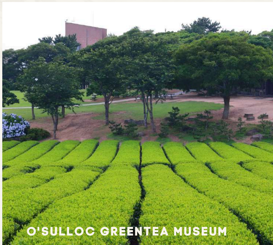
O'SULLOC GREENTEA MUSEUM