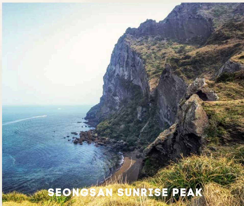
SEONGSAN SUNRISE PEAK