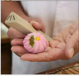
DIY Wagashi Workshop 和菓子手作体验