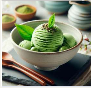
Matcha Ice Cream 日式抹茶冰淇淋