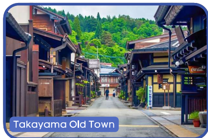
Takayama Old Town

🏠 Hotel: Fuji Kawaguchi Lake Resort or Similar (Local 4 star)