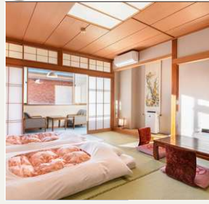
Tatami Room Experience 榻榻米房体验