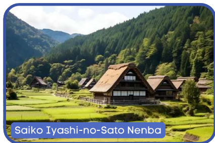
Saiko Iyashi-no-Sato Nenba

🏠 Hotel: Hotel Mystay Premier Omori or Similar (Local 4 star)